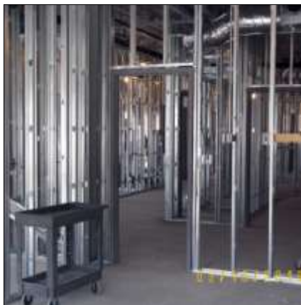
Our newest classrooms are in the works.

We provide outstanding individualized education, training, and intervention to children and young adults with autism, allowing those we serve to achieve their full potential and participate as fully as possible in family and community activities throughout their lives. We can't do this without your support!