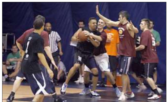
Fierce competition on the courts