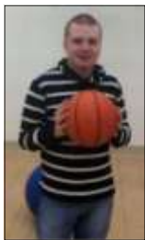
March Issue 2010

Saturday, September 25, 2010 is the date for the Give Them Wings Dinner & Auction