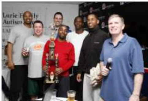
FCCC Winning Teams Nomura Securities (above) Donahue's (right)