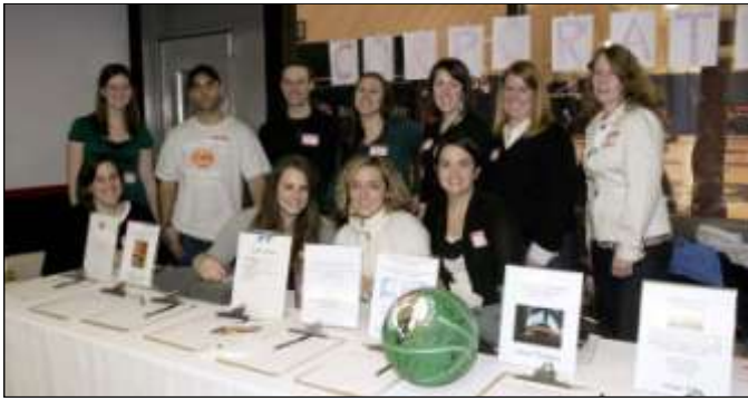
NLG staff volunteer at the FCCC