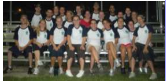
NLG'S VICTORIOUS SOFTBALL TEAM